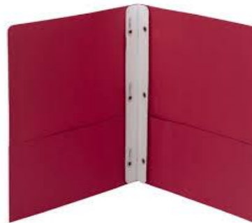
Duo-Tang style notebook