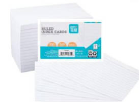
Ruled index cards