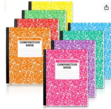
standard wide ruled composition notebook (for Language arts and Foreign Language)