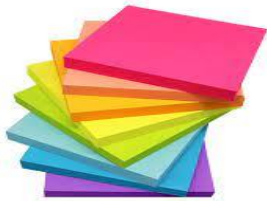
Sticky Notes/ Post-it Notes