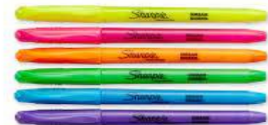
Thin multicolor highlighters