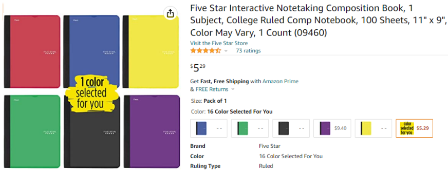
Interactive Notetaking Composition Notebook (for math and science)