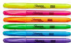
Thin multicolor highlighters