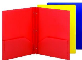
Duo-Tang style notebook (with pockets and prongs)